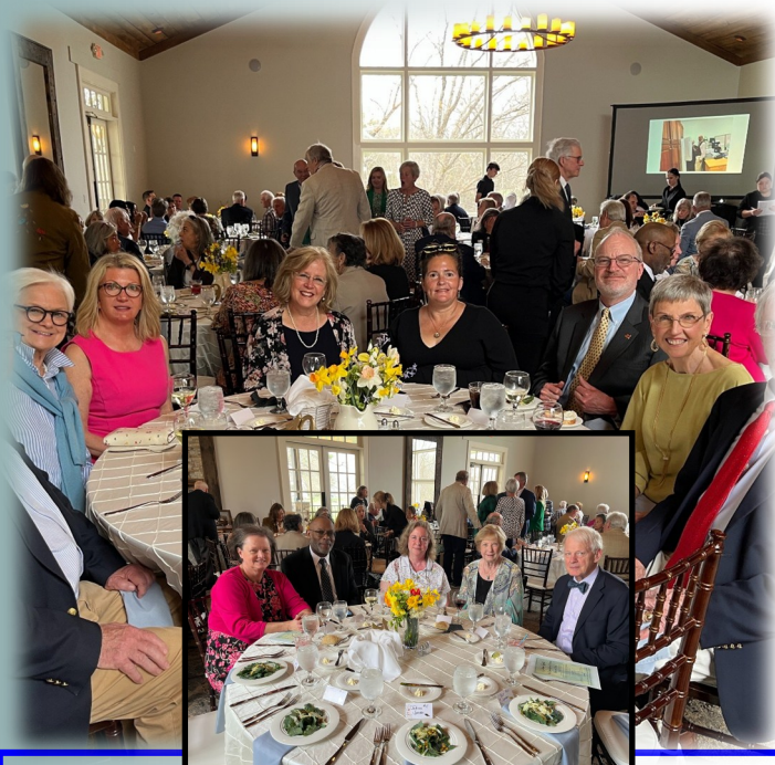
Full House at the Inn at Willow Grove– Hope Blooms Gala Fundraiser– March 29, 2025