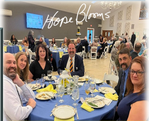
UVA Health Culpeper Medical Center – Hope Blooms Gala- supports the clinic with in-kind healthcare services for patients , grants for services, programs and so much more!