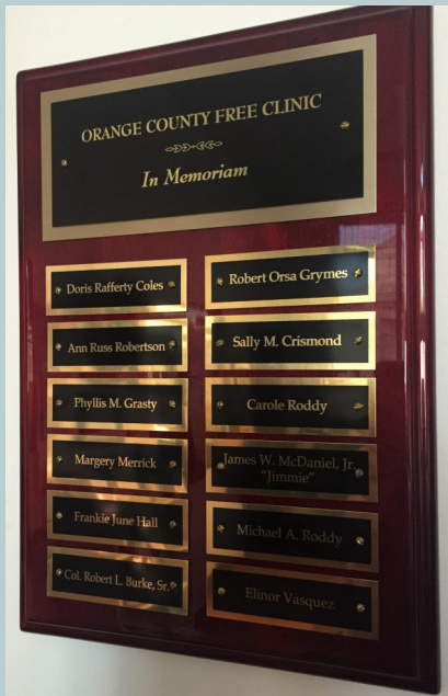
Above: A beautiful Memorial Plaque is displayed in the Clinic waiting room.

Thoughtful gifts made in this way honors loved ones while helping others!