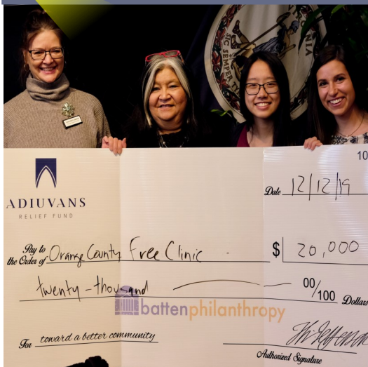
Above– Batten School's Philanthropy Program Students present $20,000 to OCFC from Adiuvans Relief Fund for Chronic Patient Care Management program.