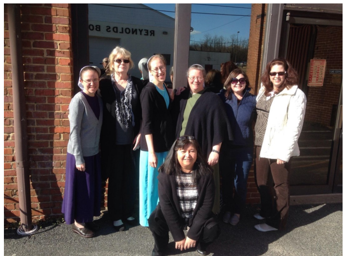
OCFC Staff at new clinic site 103 Woodmark Street in Orange