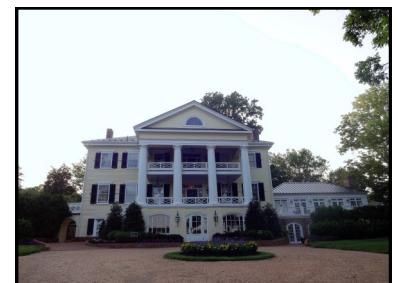
Inn at the Willow Grove, Orange, Virginia